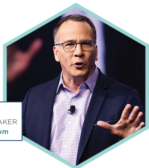
RON TITE KEYNOTE SPEAKER www.rontite.com

EXPLORE OUR NEW WEBSITE! defenceandsecurity.ca/smeday